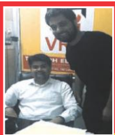
AYUSH SINHA IAS 2017