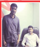
ABHISHEK KHANNA IAS 2017