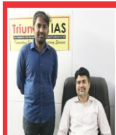
KOYA SREE HARSHA IAS 2017