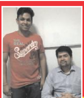
ANSHUL SINGH IAS 2017