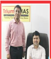
TEJAS N. PAWAR IAS 2017